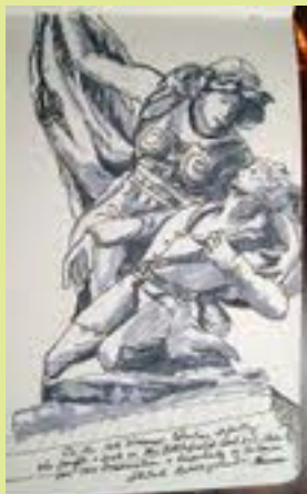
• Shilo Monument