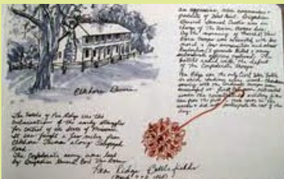
• Pea Ridge Battlefields