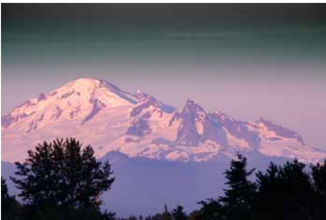
"Mout Baker Early in the Evening"