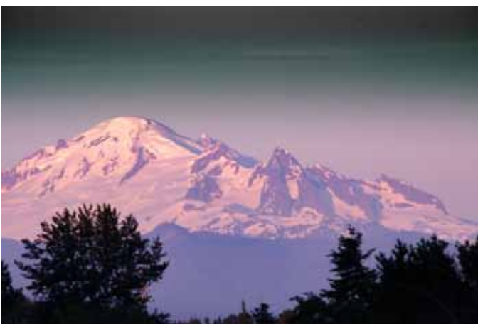
"Mout Baker Early in the Evening"