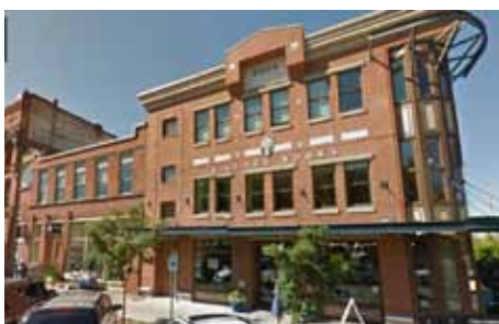
Colophon Café & Village Books