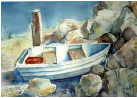
Painting by Arlene Mortimer

A group of the "plein air artists" are having a showing of their work at the Book Fare Café on the top floor of Village Books in Fairhaven. Please come by and see a wide range collection of pieces. The café has great food and drink with a view of the bay as well.