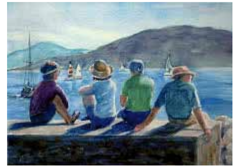
Painting by Arlene Mortimer

A group of the "plein air artists" are having a showing of their work at the Book Fare Café on the top floor of Village Books in Fairhaven. Please come by and see a wide range collection of pieces. The café has great food and drink with a view of the bay as well.