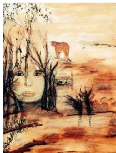
"Mother Nature is Watching"