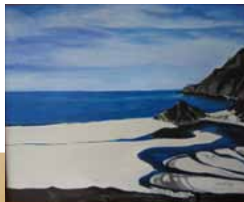
"California Beach Tides"