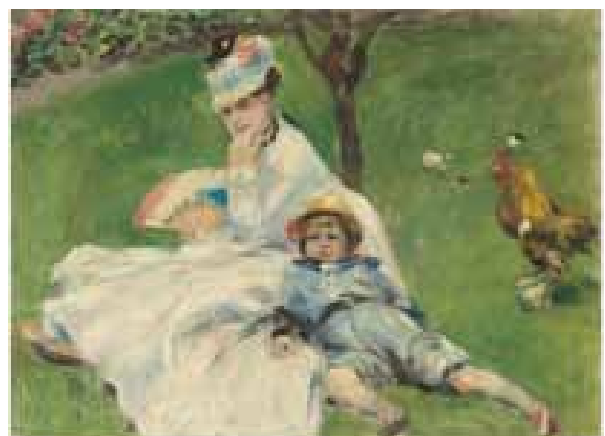
MADAME MONET AND HER SON, 1874, AUGUSTE RENOIR.