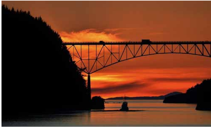
"Into the Sunset"