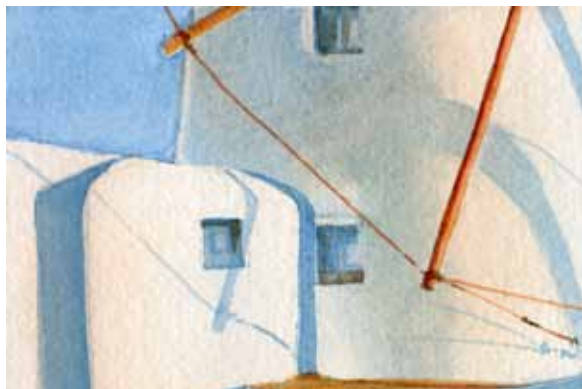
"Windmill in Mykonos"

Send completed form with check (payable to Whatcom Art Guild) to: WAG Membership, P.O. Box 3005, Bellingham, WA 98227