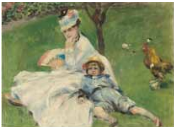
MADAME MONET AND HER SON, 1874, AUGUSTE RENOIR.

The Seattle Art Museum is proud to present Intimate Impressionism from the National Gallery of Art (in Washington, DC). The collection is comprised of extraordinary paintings, considered to be the jewels of one of the finest collections of French Impressionism in the world.