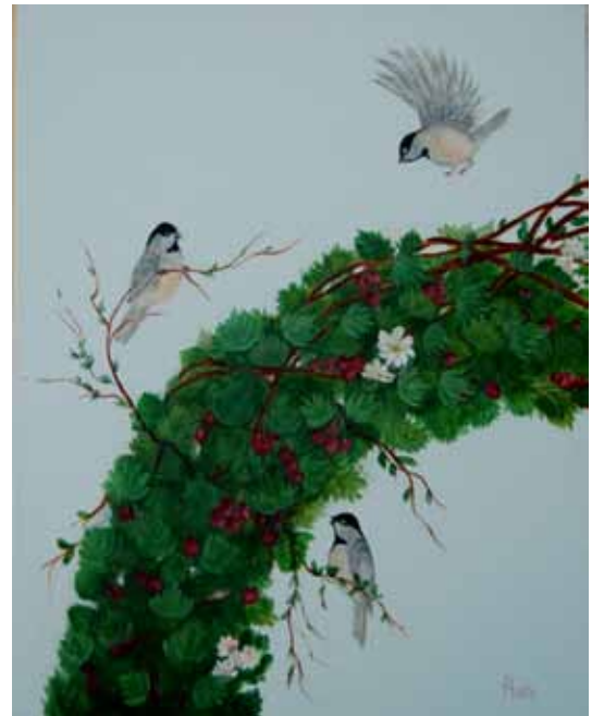
"The Taste Testers"