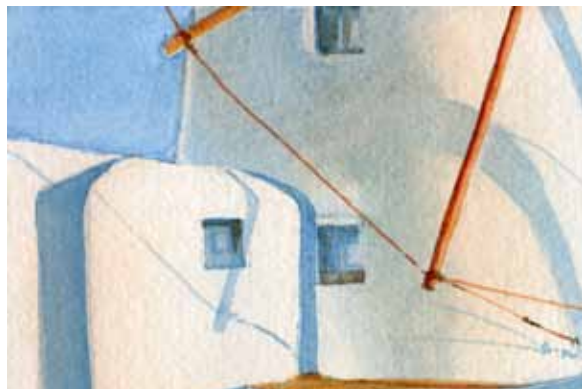
"Windmill in Mykonos"

Send completed form with check (payable to Whatcom Art Guild) to: WAG Membership, P.O. Box 3005, Bellingham, WA 98227