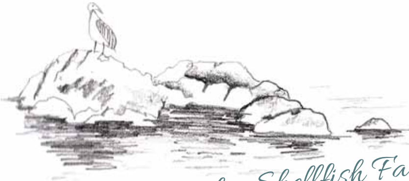
Taylor Shellfish Farm